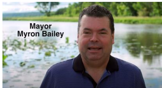
Mayor Myron Bailey

Cottage Grove residents know just how valuable our water supply is, and they're extremely familiar with the need for future water conservation. Well, Mayor Bailey needs your help! He's signed the City up for the "National Mayor's Challenge for Water Conservation," an initiative created to reward residents for positive conservation actions and set goals to promote changes in consumer behavior. Boasting more than 3 dozen miles of Mississippi River shoreline puts Cottage Grove in a unique position to participate in this extremely important challenge. Plus, reducing everyday water use can have a positive effect on your personal finances!