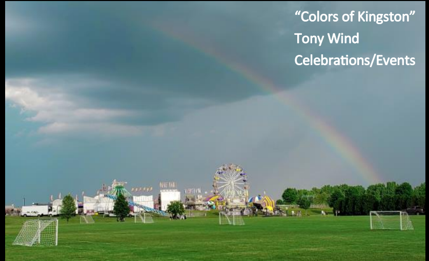
"Colors of Kingston" Tony Wind Celebrations/Events