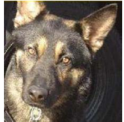
Cottage Grove Police K9 Blitz Jan. 8, 2006 – Aug. 25, 2017

The Cottage Grove Police Department is mourning the loss of retired K9 Blitz. Blitz died at home surrounded by his family during a spectacular “blitz” (German for lightning) storm late Friday, Aug. 25. His health had been declining in recent months and he struggled to maintain his mobility due to degenerative spinal myelopathy. Blitz loved coming to work every day to watch over officers during their shift, meeting people of all ages at numerous community events and using his nose to find lost people, criminals, and illegal drugs.